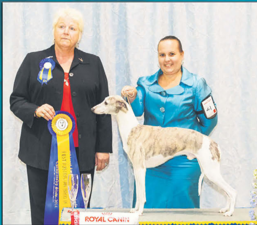
RUBIS AUST. CH. ELMARO SPARE ME THE DETAILS MULTIPLE BEST IN GROUP WINNER MULTIPLE CLASS WINNER AT SPECIALTIES