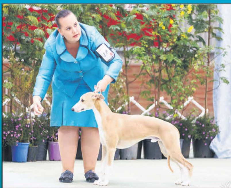
AUST. CH. ELMARO HARD ACT TO FOLLOW 2015 ROYAL BRISBANE SHOW – BEST OF BREED MULTIPLE CLASS WINNER AT SPECIALTIES CO-OWNED WITH SARAH BURN