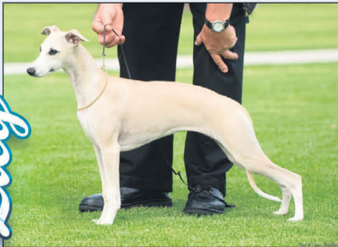
CHAKRATA DAFFODIL LIL (Gunn/Curran)