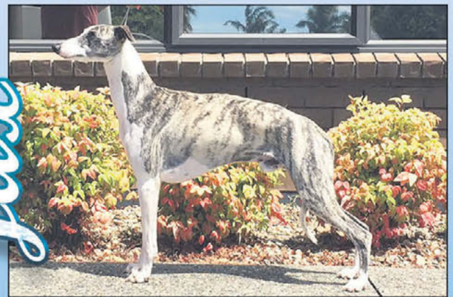
NZ CH CHAKRATA HOI POLOI AT SHENACE (EXP NZ) (Watson)