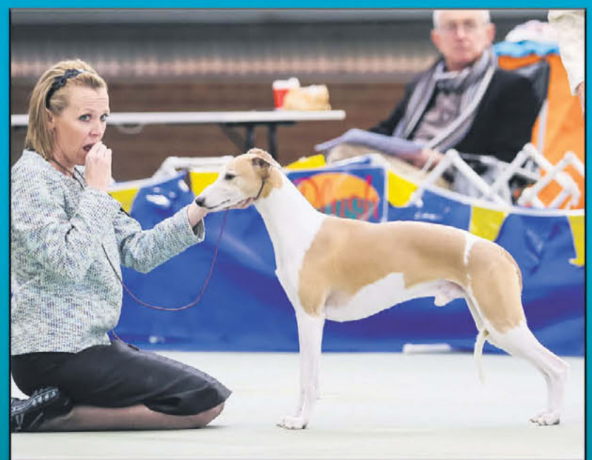
MBIS/MBISS SUP. CH. PEPPERONE NEW SENSATION 5 TIME SPECIALTY BEST IN SHOW WINNER INCLUDING THE 2013 WHIPPET NATIONAL 7 TIME ROYAL BOB WINNER