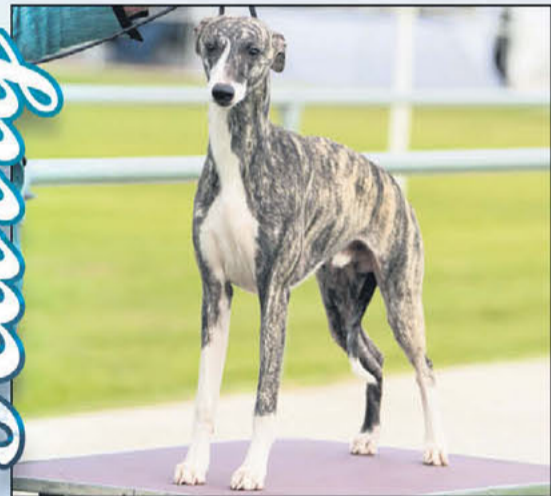
CH CHAKRATA CALYPSO CASANOVA (Curran)