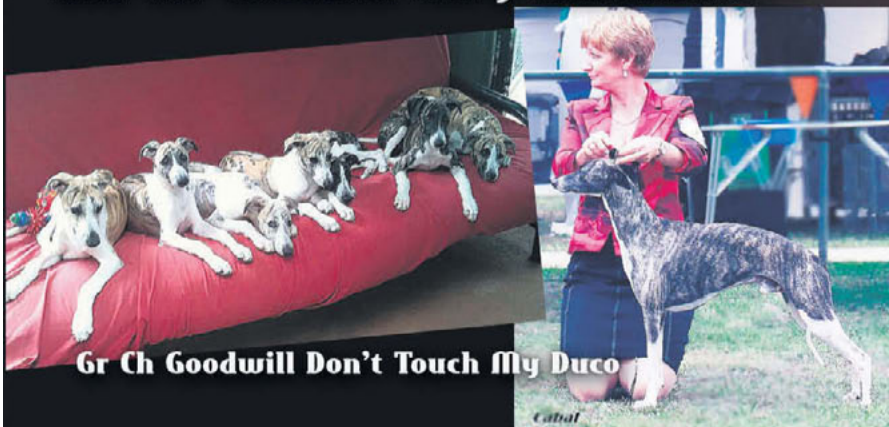
Gr Ch Goodwill Don't Touch My Duco