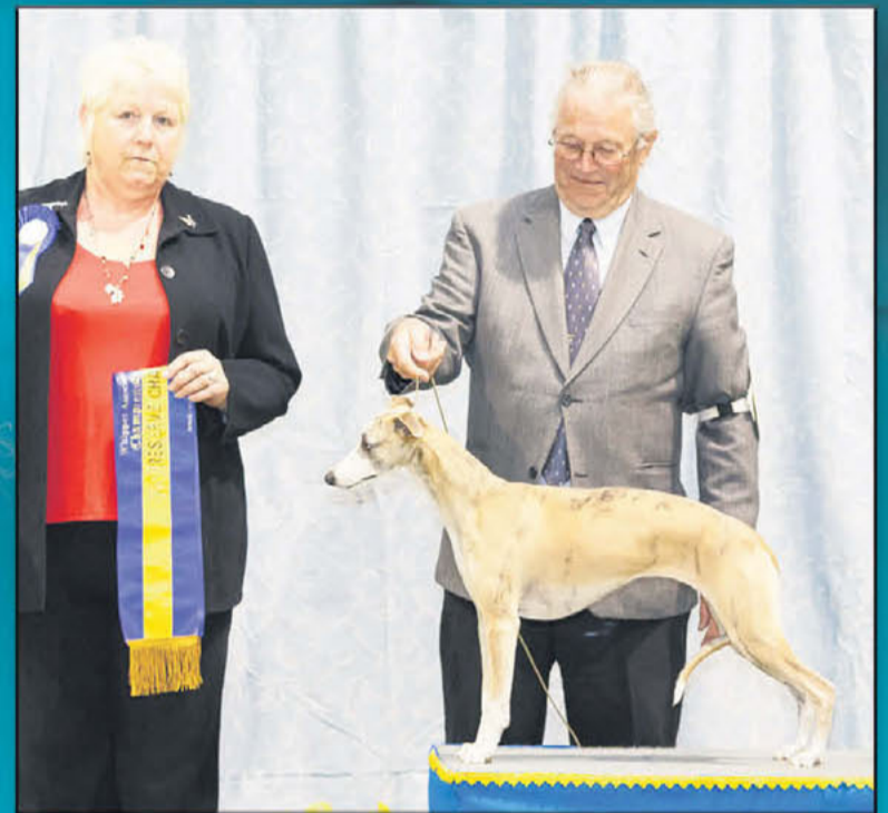
RUBISS ELMARO SWEET AS SUGAR RUBISS – 2014 VICTORIAN WHIPPET CHAMPIONSHIP SHOW (12 MTHS OF AGE) BOB 2015 VICTORIAN WOMENS DOG CLUB