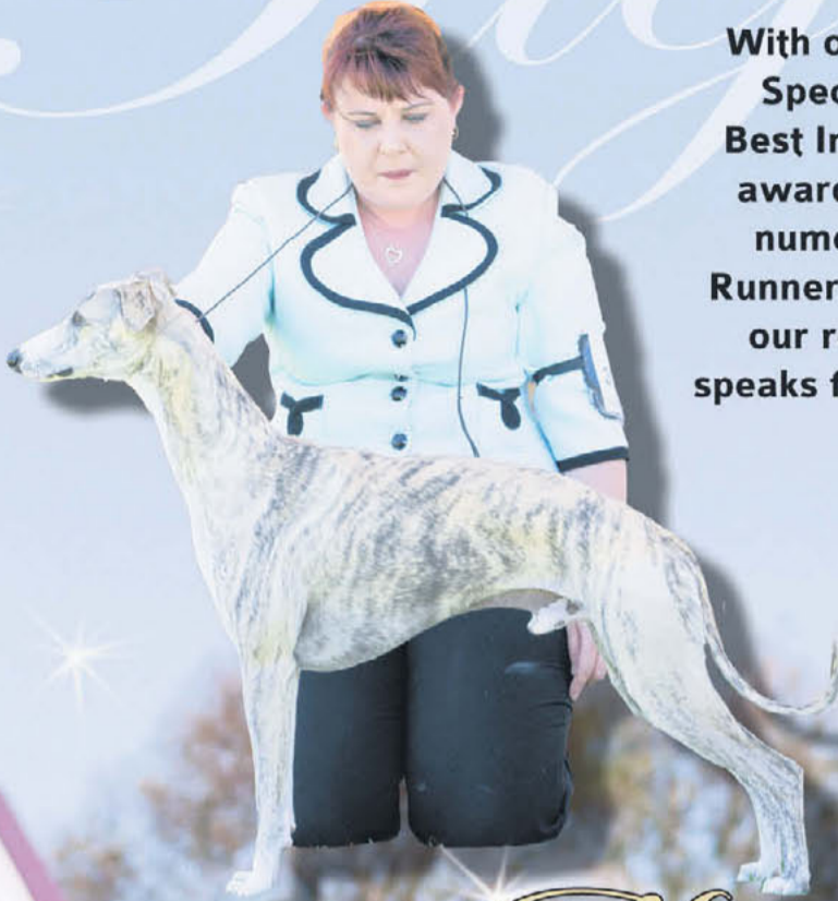
Ch Taejaan Rendezvous In Paris (AI)