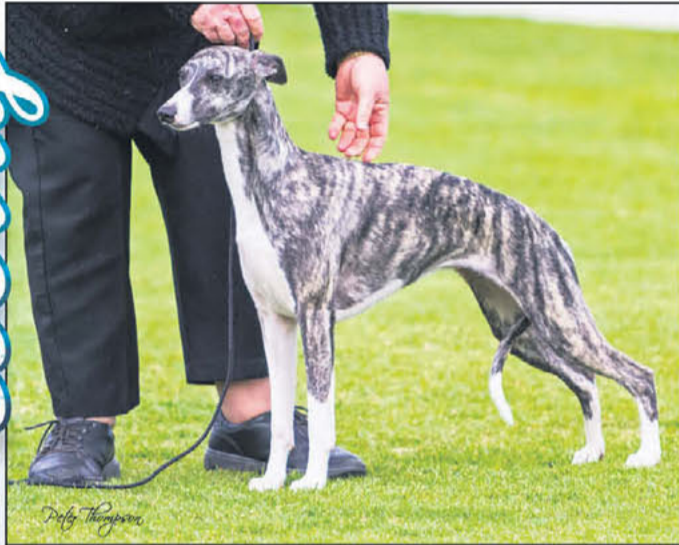
AUST CH CHAKRATA TART WITH THE CART (Curran)