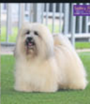
SUP CH HASHKI JUST GO WITH IT