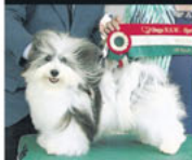
GR CH HASHI LORD OVTH RINGS

BREEDER OF BEST IN SHOW WINNERS AT TOY SPECIALTY & ALL BREEDS LEVEL