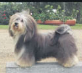
GR CH HASHKI ZUBARU