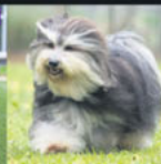
SUP CH HASHKI LITTLE BEAR