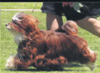
SUP CH HASHKI KAMIKAZE KID